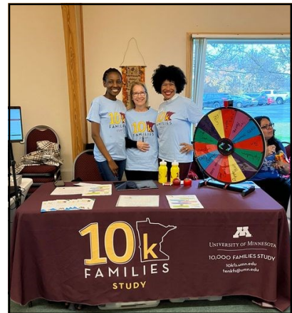
10KFS at the Hubbard County