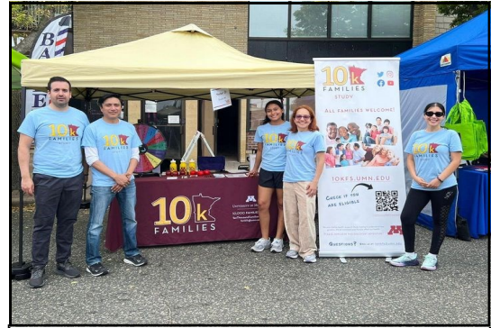
10KFS at the Fiesta Latina.

10KFS also did a tailgate experience prior to the Minnesota Gophers' home opener football game.