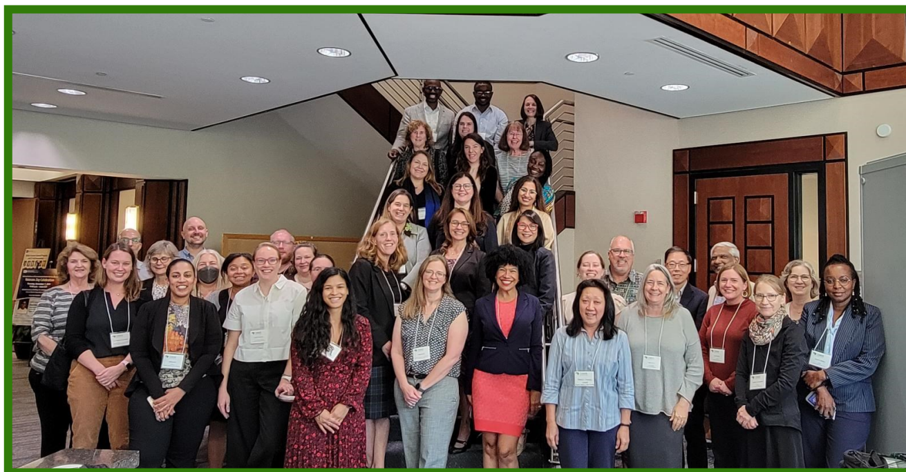
Team photo of the CEECR Annual Meeting at NIEHS in Durham, North Carolina