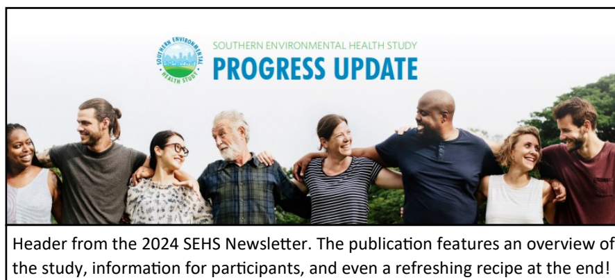
Header from the 2024 SEHS Newsletter. The publication features an overview of the study, information for participants, and even a refreshing recipe at the end!